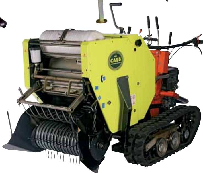
MOUNTAINPRESS 550 CNG

CAEB INTERNATIONAL srl via Botta Bassa, 22 - 24010 Petosino di Sorisole (BG) - Italy tel. +39 035 570451 - fax +39 035 4129105 - info@caebinternational.it - www.caebinternational.it