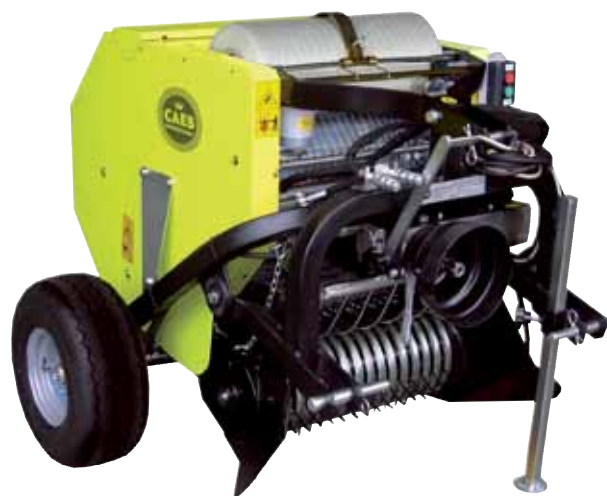
MOUNTAINPRESS 550 TPC