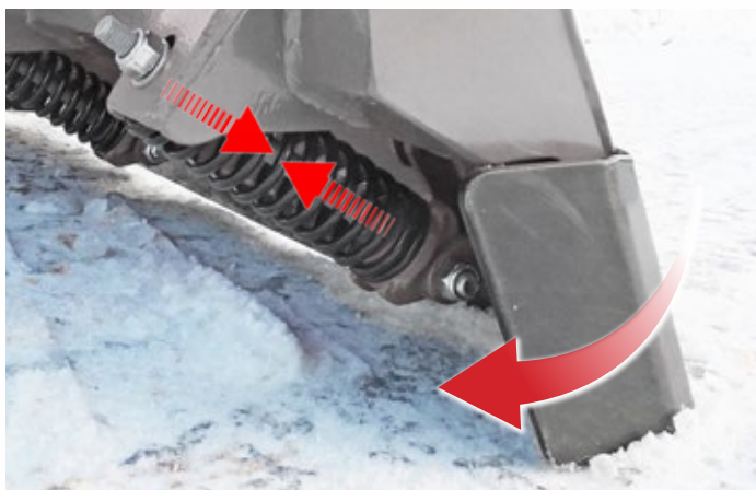
Cutting edge with trip springs