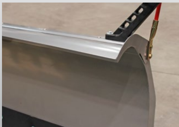
Optional snow deflector in steel (straight-blade)