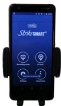
StrikeSmart™ Smart phone control