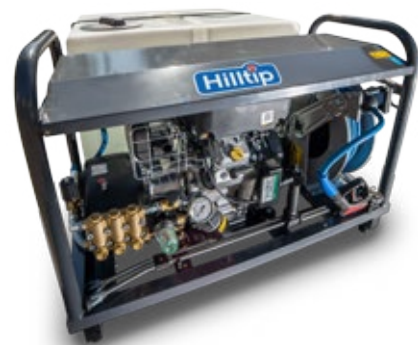
Jet-It™ cold water pressure washer

These versatile 350-1000 l mobile pressure washers are designed for use on pickups, trailers, tractors and other similar equipment. Their wide application areas enable easy washing/spraying of yards, graffiti, gardens, pavements, stairs, roofs, machines, facilities etc.