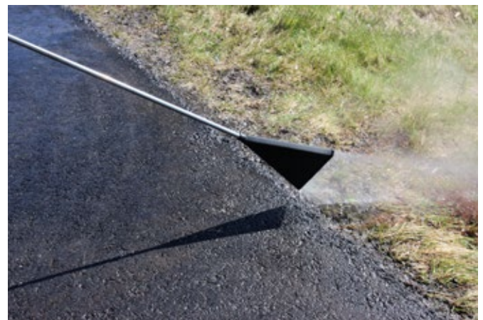
Optional weed control nozzle kit WD 01