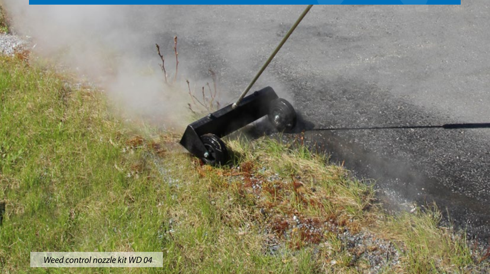
Weed control nozzle kit WD 04