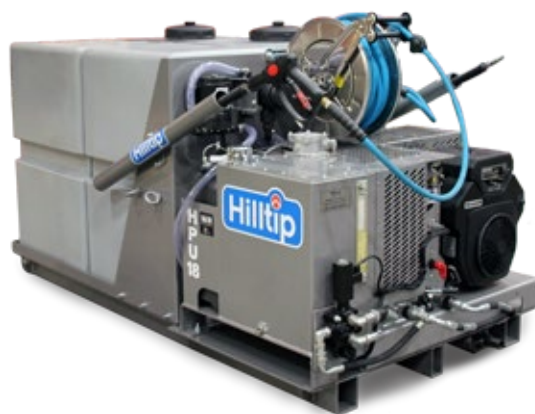
Power Jet-It™ Combi 1000 l

The Power Jet-It™ Combi is designed for installation onto pickups, flat beds, trailers and other similar vehicles. The Combi unit is available in two different watertank capacities, 500L and 1000L. The total length of the 500L model is only 135cm. This makes it fittable on even Double-Cab Pickups!