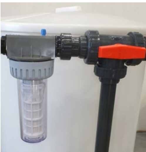
Heavy duty filter and 3-way valve