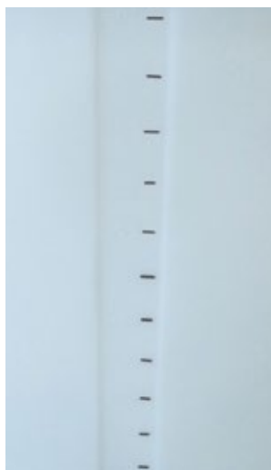
Liquid level indicator