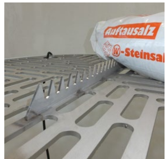
Sharp edge to cut bags

Salt-savings are between 30% - 75% with this de-icing technology, which also makes it the most environment-friendly ice control system on the market.